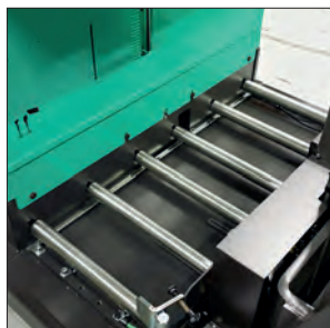
Battery on steel rollers