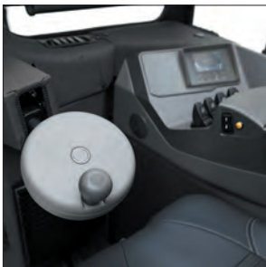
Midi steering wheel (option)