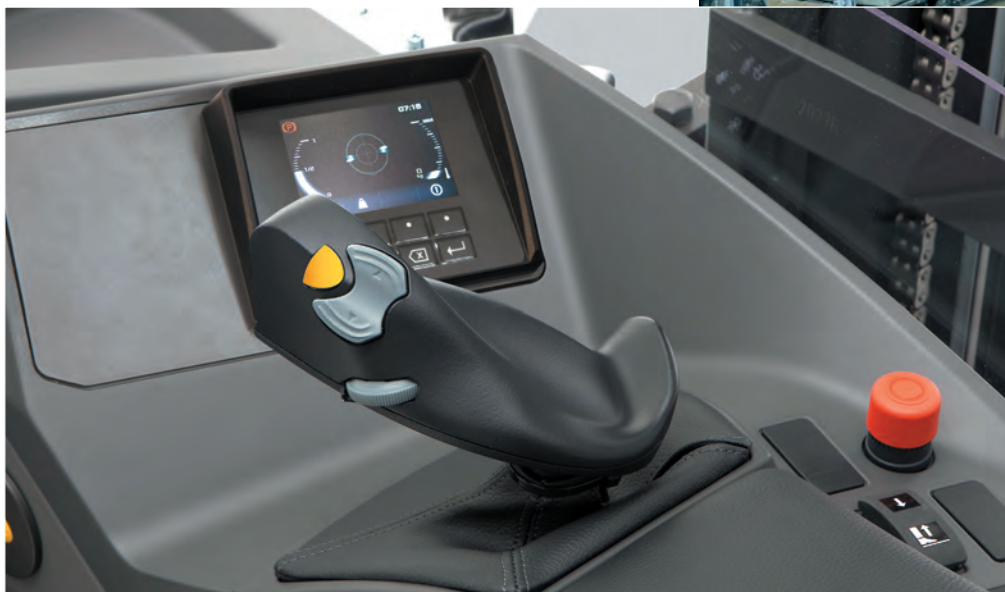
Multifunctional Ergologic Joystick