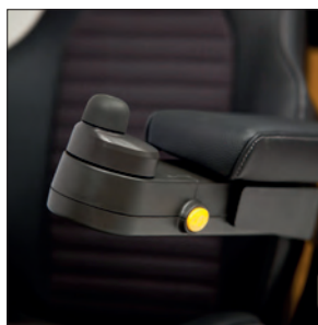
Mini steering wheel