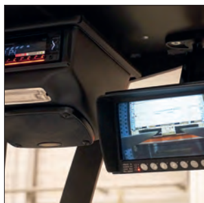
Video camera monitor