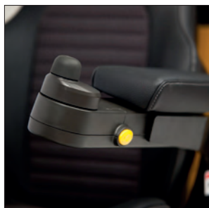
Mini steering wheel