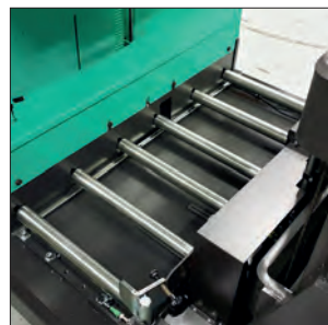
Battery on steel rollers (option)