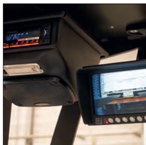
Video camera monitor

The THD13-15N3 Series offers market-leading performance – with top speeds of up to 14 km/h. This is combined with ergonomic design and comprehensive safety features to ensure high productivity through incredibly efficient, safe operation.