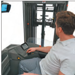
Optional fingertip controls