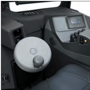
Midi steering wheel (option)