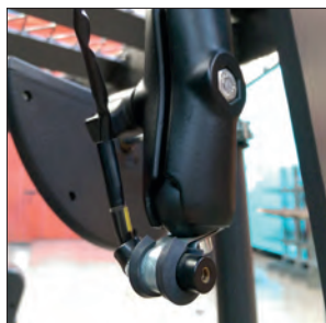
Position light laser