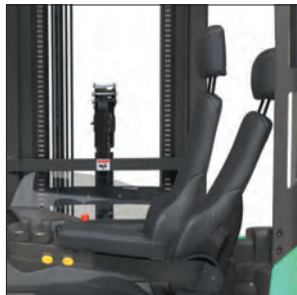
18 degree tilting backrest