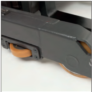
Rail guidance, RB14N3C only (optional)