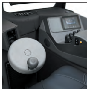
Midi steering wheel (option)