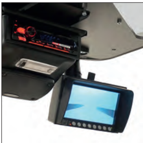
Video camera monitor