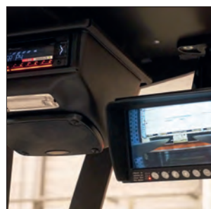
Video camera monitor