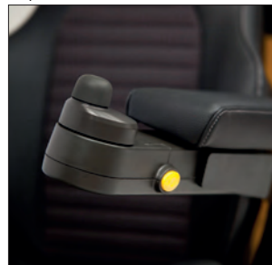
Mini steering wheel