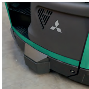
Wire guidance (sensor)