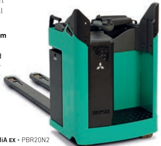
PREMiA EX • PBR20N2

The operator can keep the truck in constant motion — saving seconds on every turn.