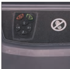
PIN code log in