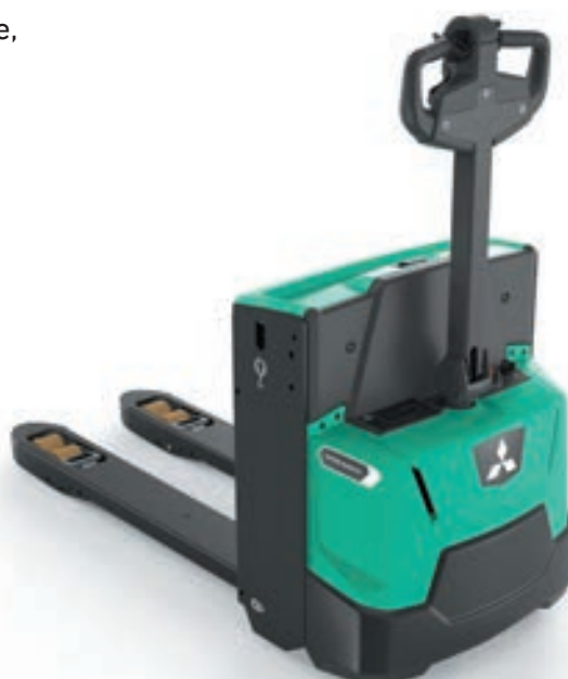
PREMiA ES • PBP160N3