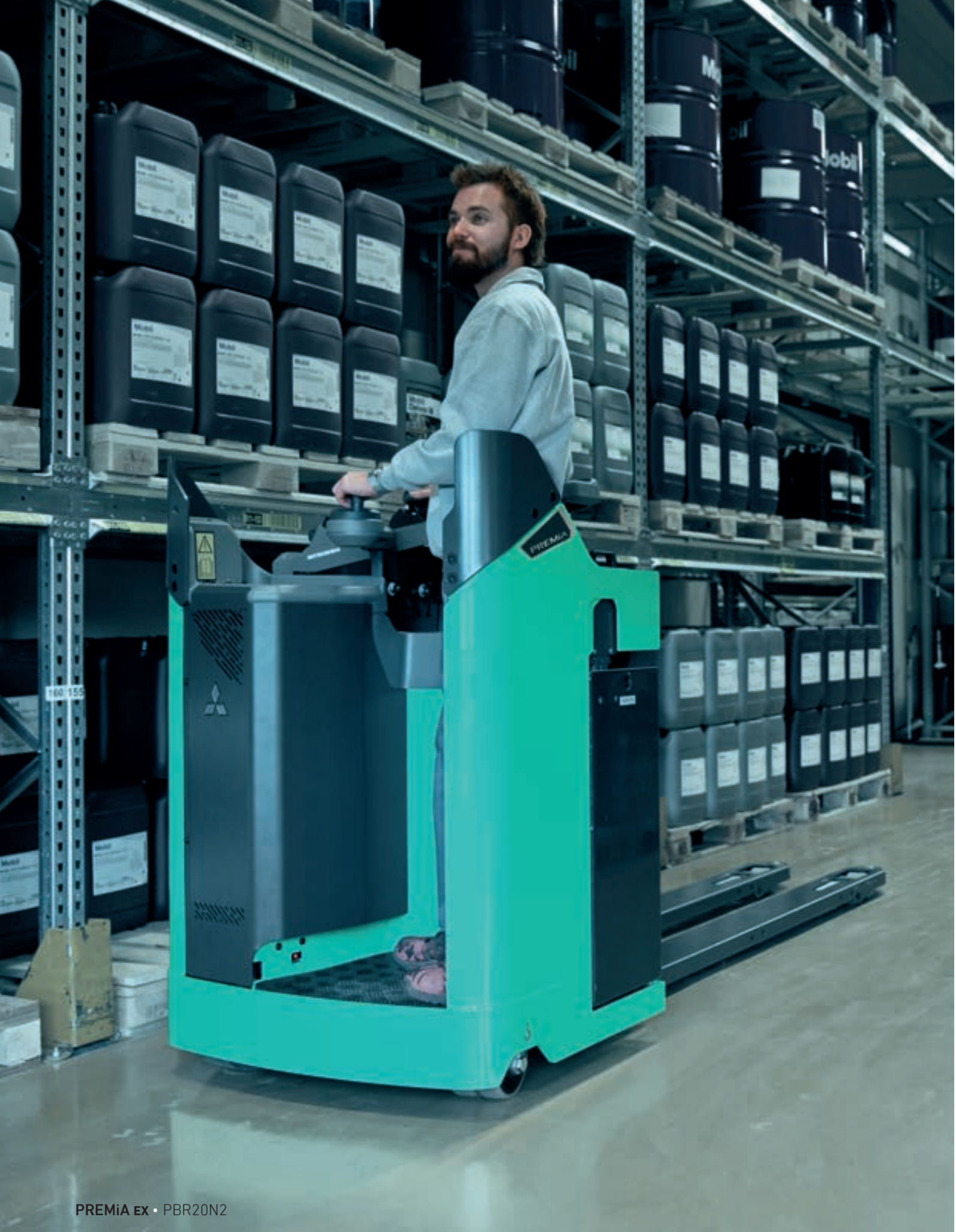
PREMiA EX • PBR20N2