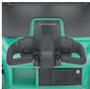
ErgoSteer tiller head