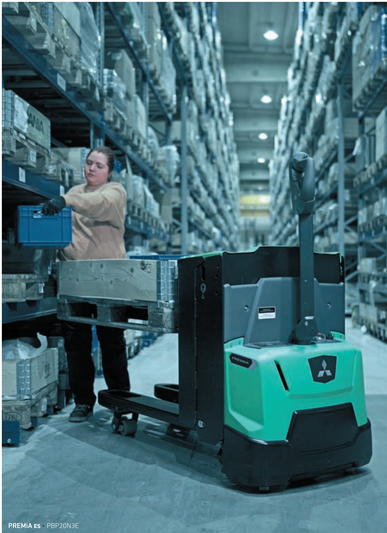
PREMIA ES • PBP20N3E