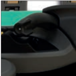
Ergonomic handle with drive control