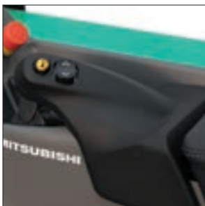
Direction switch on handle