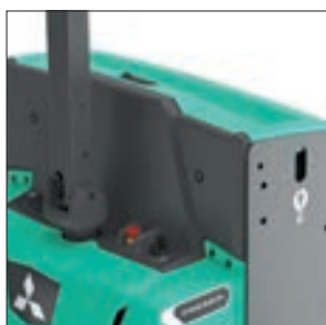
Hingeless steel battery lid

Developed for non-stop performance in the most challenging environments, PREMiA ES pedestrian power pallet trucks help you go the distance. Thanks to its sealed protective chassis and waterproof components (rated to IP54), PREMiA ES is unaffected by dirt, debris, dust, and water, working dependably indoors or out with minimal maintenance.