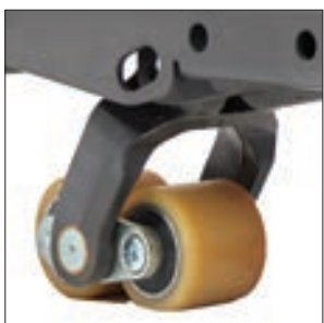
Dust-shielded load wheels