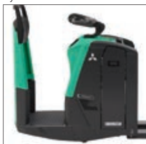
Ultra-low step height