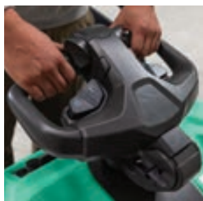
ErgoSteer tiller head

The PREMIA EM range is available in three variations: foldable platform, fixed platform rear entry, and fixed platform side entry. Each truck is available in either 2 tonne or 2.5 tonne capacities. All trucks feature a heavy-duty chassis in 3 possible sizes: mini, junior and senior to suit all battery requirements. The mini chassis is also the shortest on the market.