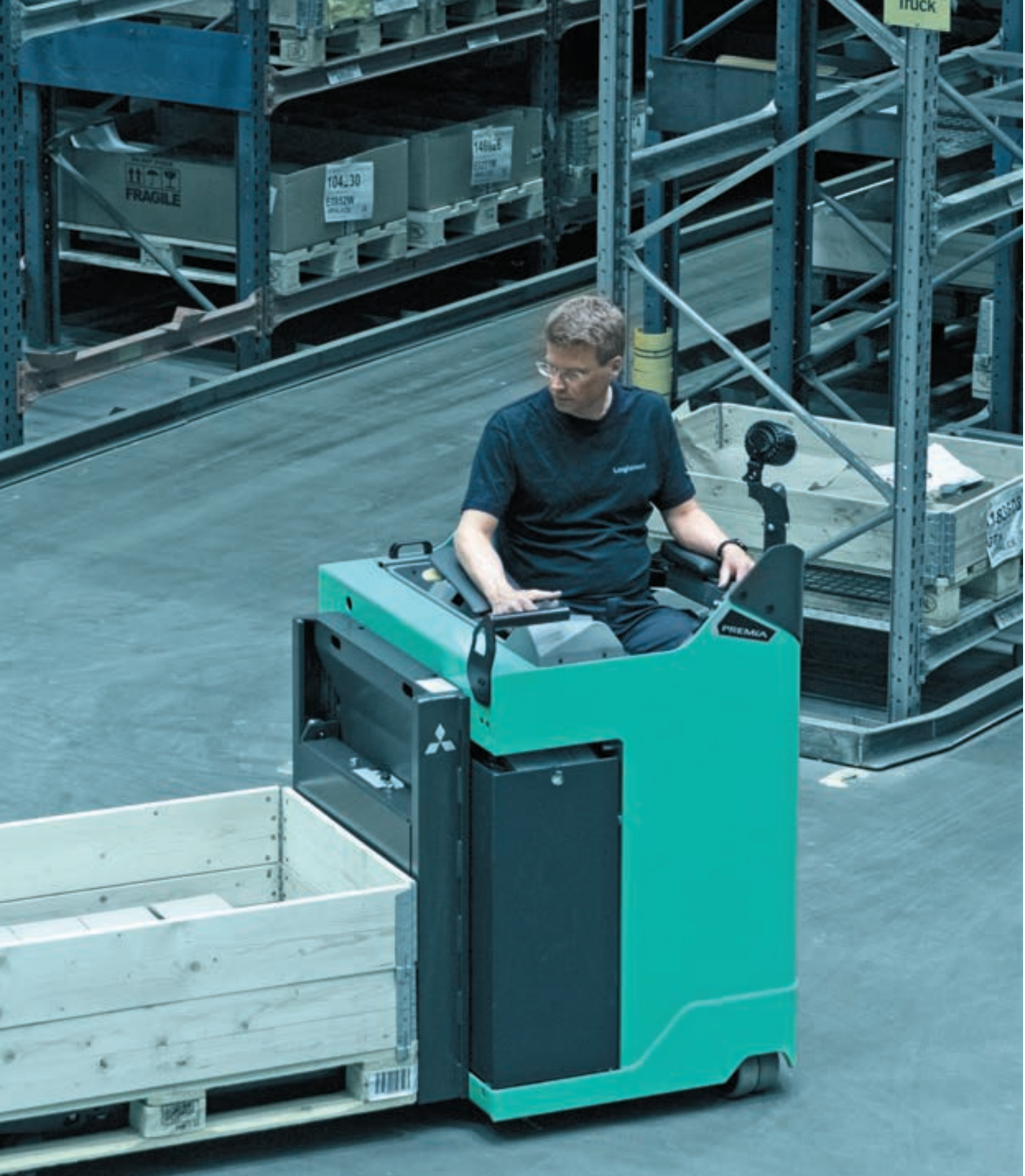
PREMiA EX • PBR20N2