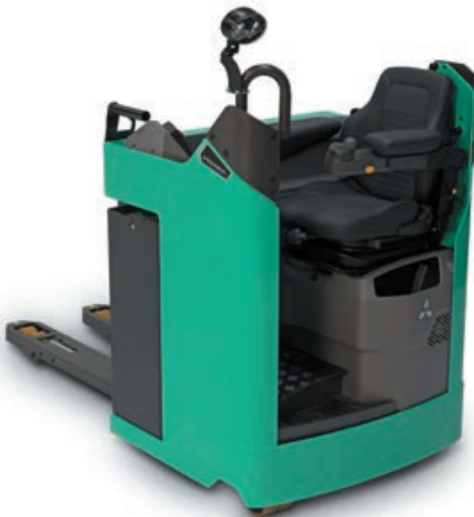
PREMiA EX • PBS20N2