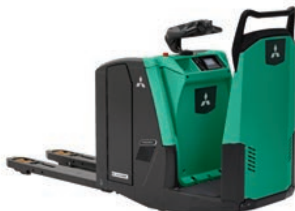
PREMIA EM • PBF20N3S

Features a sophisticated CANbus communication and an automatic ON/OFF synchronization between battery and truck. Battery level, notifications and alarms are integrated into the truck display, to secure clear and easy overview for the truck operator.