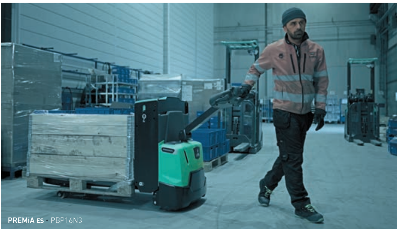
PREMiA ES • PBP16N3