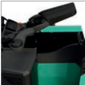
Adjustable armrest storage