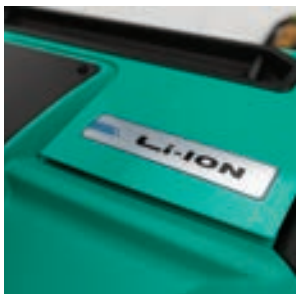
High capacity batteries