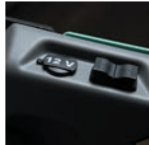
12V DC Power Socket