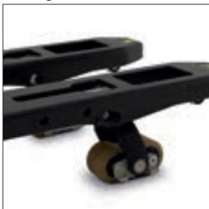
Tapered and angled fork tips

For horizontal transport over medium-to-long distances, ensure your operators have the comfort and safety benefits of a stand-in power pallet. The ergonomic controls, comfortable operator compartment, and easy entry and exit make longer shifts stress-free and far less fatiguing for the drive