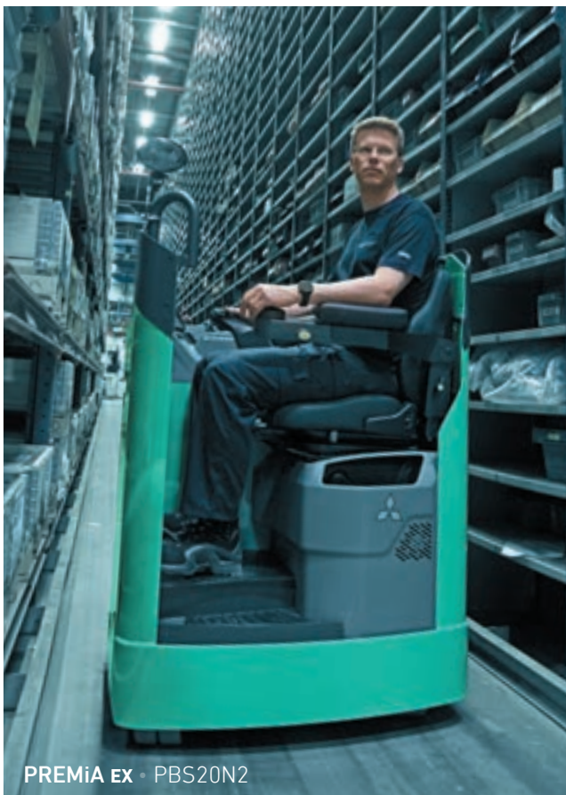
PREMiA EX • PBS20N2