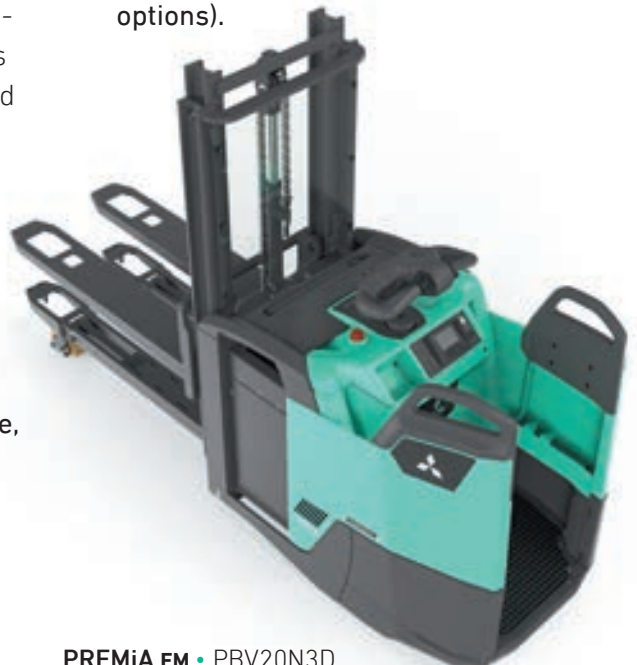
PREMiA EM • PBV20N3D

Spring-loaded system works with DriveSteady to continuously increase pressure of the drive wheel. This ensures optimum traction on wet surfaces for better productivity and minimal risk of accidents. (Available on mechanical and power steering options).