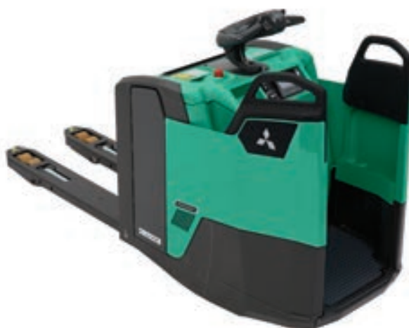
PREMIA EM • PBF20N3R

Fitted as standard for battery protection and preventing deep discharge.