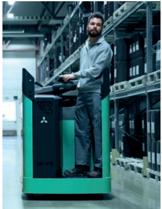
PREMiA EX PBR20-30N2 Series