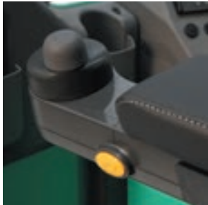
Dynamic Power Steering