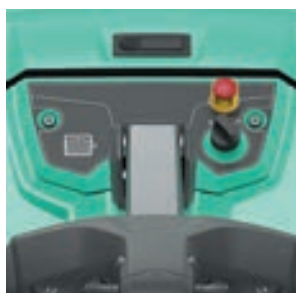
Advanced programmable controller