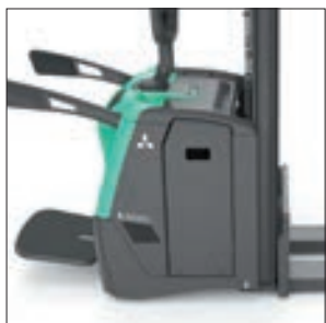
EasyRide adjustable dampening system

The PREMiA EM double pallet handler is built for highly demanding work where performance and precision are key. It's available in both fixed platform and folding platform configurations with fast acceleration and drive speeds, and market-leading lifting and lowering speeds. The initial lift feature allows for higher ground clearance when needed and allows for the transportation of stacked pallets, doubling productivity, and reducing the time needed to move them from A to B.