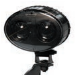
LED working lights