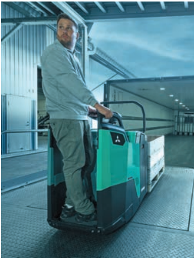
PREMiA EM PBV/PBF20-25N3(R)(S) Series

Combine with Mitsubishi Forklift Trucks stability enhancing technology such as DriveSteady and TractionPlus and you'll see why powered pallet trucks are a safe, smart, and cost-effective choice.