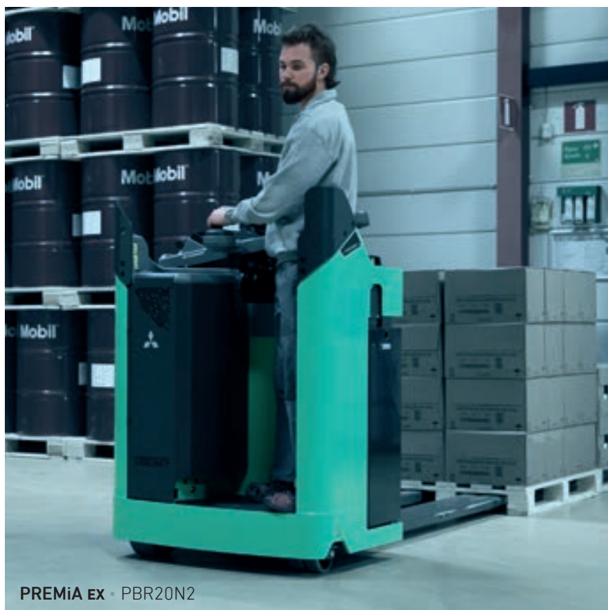
PREMiA EX • PBR20N2