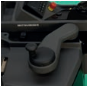
Adjustable steering wheel